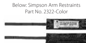
Below: Simpson Arm Restraints Part No. 2322-Color