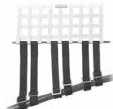
Above: Strap Mount Kit Part No. RQP705005 Loop Type Net and Mounting Rod Kit sold separately