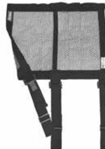
Left: Mesh Window Net, With Bottom Straps, Large 18" x 24" Part No. RQP824995