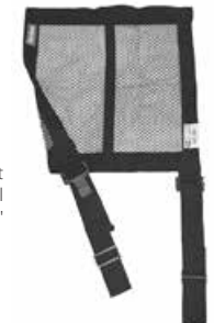
Right: Mesh Window Net with Bottom Straps, Small 15" x 18" Part No. RQP824991