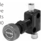
Right: Tilton Knob-Style Proportioning Valve with 3/8-24 Ports Part No. TE 90-2000

Brake Proportioning Valves Allow a driver to reduce brake pressure to a specific wheel or wheels. This can be used to adjust front-to-rear brake bias in cars where brake balance bars are not allowed or are not practical. The maximum reduction of output pressure is approximately 50% of the input pressure. Complete instructions are included.