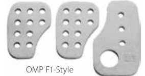
OMP F1-Style Pedal Pad Set Part No. OMP-OA1030

These kits give you a wider surface area for better contact and feel than your stock pedals. Each kit includes 3 aluminum pads (clutch, brake, throttle) and attachment hardware.