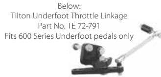
Below: Tilton Underfoot Throttle Linkage Part No. TE 72-791 Fits 600 Series Underfoot pedals only