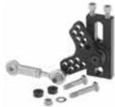
Left: Tilton Standard Throttle Linkage Part No. TE 72-791 Fits 600-Series pedals except Underfoot