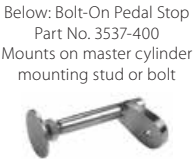
Below: Bolt-On Pedal Stop Part No. 3537-400 Mounts on master cylinder mounting stud or bolt

Tilton uses Finite Element Analysis (FEA) to design the strongest pedal assemblies possible without adding excess weight. All are designed to accept any master cylinders with standard 2.25 inch mounting hole spacing (master cylinders sold separately). The brake pedals are designed for dual master cylinders and are equipped with an adjustable bias bar which can accept a remote cable (sold separately). The clutch pedals are designed for hydraulic clutch actuation. All pedals feature adjustable pads. The Overhung Mount and Underfoot Mount versions point the master cylinders toward the rear of the car, over or under the driver's feet. The Firewall and Floor Mount units point the cylinders forward. The Tilton assemblies also feature adjustable-height pads on the brake and clutch pedals.