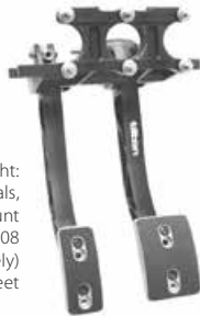
Right: Tilton Dual Aluminum Pedals, Overhung Mount Part No. TE 72-608 Master cylinders (sold separately) point backward over the driver's feet