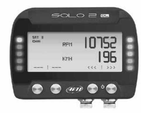
AiM Solo2 DL Lap Timer / Data Logger Part No. MC-671 / MC-672 / MC-673

The ultimate lap timer - and more! You won't believe that something so easy to use can be so powerful. The amazing AiM Solo2 uses satellite signals (both GPS and Glonass) to start and stop lap times at the start/finish line. No other equipment is required. The Solo2 automatically recognizes the track from memory, or you can add the track to the database when you arrive. Solo2 also logs extensive GPS data (exact track position, speed, acceleration rates in 3 directions, and more) for detailed analysis later. The included Race Studio software can even generate track maps and replay any two laps together for comparison. The internal rechargeable battery means no wiring connections are needed. Measures only 3.9" x 3.1" x 1.2" thick - small enough to mount directly on your steering wheel, even in a formula car.