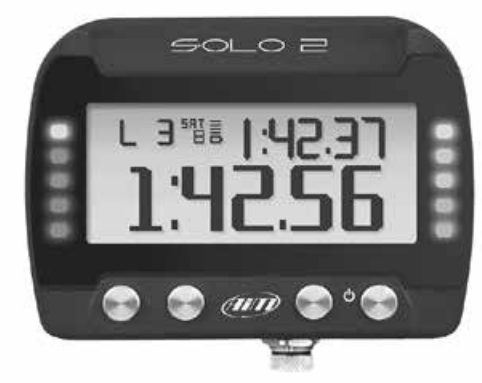
AiM Solo2 Lap Timer (stand-alone version) Part No. MC-670

If your chosen track does not have a map in GPS Manager, you can create one by running (or even walking) a single lap with the Solo2. As you go around the track, the Solo2 will record your position 10 times a second (using powerful algorhythms and other data to fill in the gaps between). Download the lap to Race Studio, and GPS Manager will let you import the track shape that was recorded on that lap. You can now use that track map on your SmartyCam's video overlay!