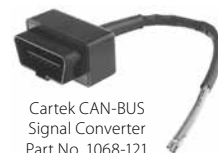
Cartek CAN-BUS Signal Converter Part No. 1068-121

Note: This converter has been designed and tested to work with Cartek shift lights and gear position indicators only. If your shift lights require you to program the number of cylinders, or your gear indicator requires you to program tire diameter or the number of pulses per wheel revolution, it will not work for you.