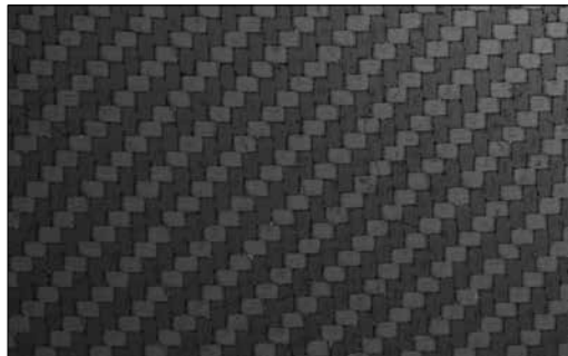
Above: Close-up of 2 x 2 carbon fiber weave. This is genuine carbon fiber, not a cosmetic dress-up with a carbon fiber pattern!