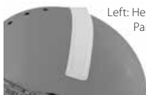
Left: Helmet Top Wicker (Small) Part No. BE208-Small

Rear Spoiler, Clear, V.06 for helmets without vents ... Part No. BE204-Clear ..... $59.95 Rear Spoiler, Clear, V.09 for helmets with rear vents ... Part No. BE205-Clear ..... $59.95