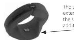
Below: OMP Anatomical Neck Collar Part No. 2123-Color

The anatomical shape extends down between the shoulders for additional support