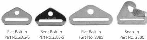
Flat Bolt-In Part No. 2382-6 Bent Bolt-In Part No. 2388-6 Flat Bolt-In Part No. 2385 Snap-In Part No. 2386

Bolt-In End Plates Available either flat or bent with \frac{3}{8} " or \frac{1}{2} " mounting hole. For two or three inch wide straps (see diagram below right for installation): \frac{3}{8} inch Mounting Hole FLAT Bolt-In End Plate ..... Part No. 2382-6 ..... $4.99 \frac{3}{8} inch Mounting Hole BENT Bolt-In End Plate ..... Part No. 2388-6 ..... $4.99 For 3" wide straps – has a 3" wide slot and should NOT be used with 2 inch straps. \frac{1}{2} inch Mounting Hole FLAT Bolt-In End Plate ..... Part No. 2385 ..... $4.49 With 3 inch wide slot - for 3 inch straps only.