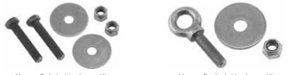
Above: Bolt-in Hardware Kit Part No. 2383 Above: Eyebolt Hardware Kit Part No. 2384