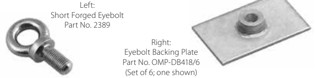
Left: Short Forged Eyebolt Part No. 2389 Right: Eyebolt Backing Plate Part No. OMP-DB418/6 (Set of 6; one shown)

These items may come in handy when installing your harness or when converting a wrap-around mount to a bolt-in or snap-in mount.