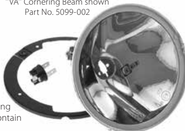
Cibié Oscar SC Driving Lamp "VA" Cornering Beam shown Part No. 5099-002

Note: An acrylic or polycarbonate fairing is highly recommended with these lamps to protect the lens from damage. Many racing organizations also require such a cover to contain any glass shards in the event of breakage.