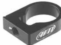
Collar Mount Adapter Part No. MC-589 Fits remote "bullet" cameras measuring 24mm (0.95") diameter

Right: Suction Cup Mount Kit Part No. MC-557 Includes 1/4-20 male stud and collar adapter for SmartyCam HD GP bullet camera