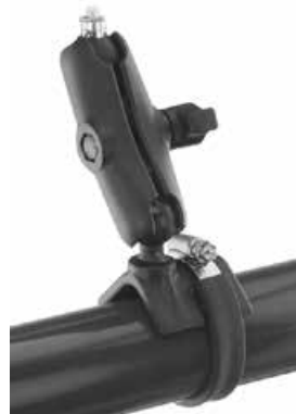
V-Base Mount Kit Part No. MC-560

Above: AiM SmartyCam HD GP (84° Lens) Part No. MC-586 Bullet camera measures 3" x 1 5/16" and weighs only 2 oz. Recording unit measures 4 1/8" x 2 1/2" x 1".