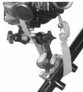
Left: Camcorder Mount Part No. 2420 Includes SCCA-mandated security strap.

SCCA rules require a security strap or tether in case the mount fails. Our 1" wide red nylon strap has a metal friction buckle to adjust quickly up to 17" diameter.