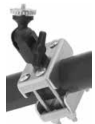
Right: Roll Bar Mount for Mini Cameras Part No. 2421-001

Both of these mounts accept cameras or adapters with the industry-standard 1/4-20 female thread.