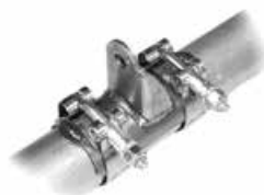
Above: Floating Saddle Mount shown installed on a chassis tube (T-Bolt clamps not included)

Put a mounting tab anywhere you want on a chassis tube with no welding required! Simply clamp a Floating Saddle Mount to your tube using two hose clamps (not included). The 1/8" thick chromoly tab is TIG-welded perpendicular to the 1/16" thick saddle (a bolt through the hole will be parallel to the tube). Generous gussets on both sides keep the tab upright. The 3/8" diameter hole is perfect for mounting control cables, but these mounts can be used in many other light-duty applications as well.