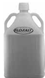
Left: 15 Gallon Clear Utility Jug Part No. 2577-031

Please Note: Flo-Fast pump systems do not include jugs or drums.