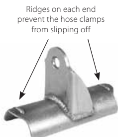
Above: Floating Saddle Mount Part No. 1825-100-Size