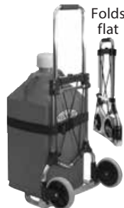
Right: Fold-Up Cart for Flo-Fast Pump Systems Part No. 2577-020 (shown with 15 Gallon Jug, sold separately)

Please see our website for many more Flo-Fast pump accessories.