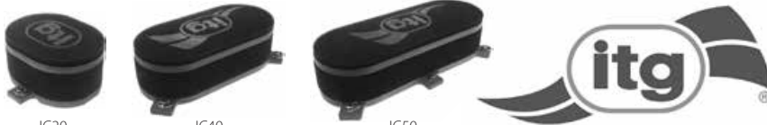
JC20 Part No. 3817-020-xxx JC40 Part No. 3817-040-xxx JC50 Part No. 3817-050-xxx

ITG Megaflow Series air filters feature 3-stage foam supported by a distinctive red band. The number after the slash indicates the internal height in millimeters (e.g., JC20/65 measures 65mm high inside; JC100/40 measures 40mm high inside). Filter elements are sold individually. Matching base plates are sold separately.