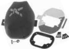
Left: Pipercross PX300 Filter Kit for Weber 32/36 DGV Part No. 1265-001 Includes Filter Element (Part No. 1265-002) and Base plate (Part No. 1265-003)