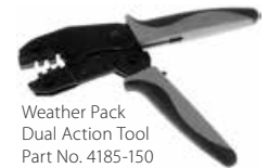
Weather Pack Dual Action Tool Part No. 4185-150

These economical tools will crimp most sizes of Weather Pack terminals and cable seals. The Pro Tool requires two separate operations to crimp the terminal and the seal. Many professionals prefer the extra level of control this allows. The Dual Action Tool crimps both terminal and seal in one single operation. Both tools have a ratcheting function to ensure consistent, uniform crimps. For 20-14 gauge terminals.