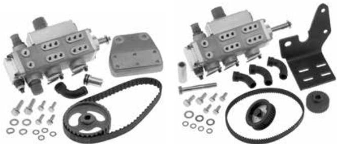
TDC / Fast Forward Dry Sump Pump Kit for 2.0L Swift Part No. 177-07-Swift TDC / Fast Forward Dry Sump Pump Kit for 2.0L Van Diemen / Lola Part No. 177-07-VD

Fast Forward Components have been designing and manufacturing Sports 2000 and FC parts for over 20 years. Their TDC brand oil pumps are proudly made in the USA to exacting quality standards. These pump kits include the pump, drive belt, pump pulley, drive pulley, mounting bracket, and pump inlet and outlet fittings.