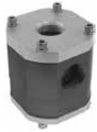
Right: Mounting Clamp for Billet Filters Part No. 1281-003