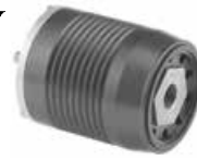
Spin-On Canton Oil Filters Left: 4.25" Filter Part No. 1283