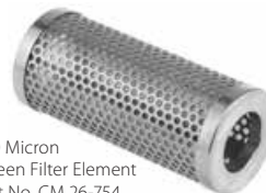
280 Micron Screen Filter Element Part No. CM 26-754