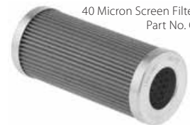
40 Micron Screen Filter Element Part No. CM 26-150

Protect your expensive dry sump pump! Install one of these screen elements in a 6" Canton remote mounted oil filter (Part No. 1281, above left) for a free-flowing scavenge filter. Coarse mesh allows free flow, yet catches the larger debris that can destroy dry sump pumps. These elements are not for use for final oil filtration. Fits tall (6") remote-mount Canton filters only. Sold individually.