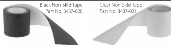
Black Non-Skid Tape Part No. 3437-020