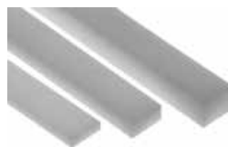
Abrasion-Resistant Polymer Wear Strips \frac{1}{4} ", \frac{1}{2} ", and \frac{3}{4} " thick Part Nos. 6101, 6102, and 6103 All thicknesses are 1" wide.