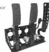
Right: OBP Victory Floor Mount 3-Pedal Box Part No. OBP-VIC01

Please visit our website for the full OBP Pro-Race and Victory lines, including Pro-Race V2 series 2-pedal and single-pedal assemblies and Victory series pedal boxes fully loaded with OBP master cylinders!