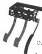
Left: OBP Victory Overhung Mount 3-Pedal Box Part No. OBP-VIC19