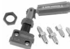
Left: Tilton Lever-Style Proportioning Valve with 3/8-24 Ports Part No. 3528-3AN