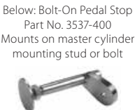
Below: Bolt-On Pedal Stop Part No. 3537-400 Mounts on master cylinder mounting stud or bolt

Tilton uses Finite Element Analysis (FEA) to design the strongest pedal assemblies possible without adding excess weight. All are designed to accept any master cylinders with standard 2.25 inch mounting hole spacing (master cylinders sold separately). The brake pedals are designed for dual master cylinders and are equipped with an adjustable bias bar which can accept a remote cable (sold separately). The clutch pedals are designed for hydraulic clutch actuation. All pedals feature adjustable pads. The Overhung Mount and Underfoot Mount versions point the master cylinders toward the rear of the car, over or under the driver's feet. The Firewall and Floor Mount units point the cylinders forward. The Tilton assemblies also feature adjustable-height pads on the brake and clutch pedals.