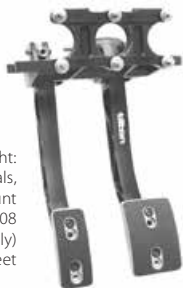
Right: Tilton Dual Aluminum Pedals, Overhung Mount Part No. TE 72-608 Master cylinders (sold separately) point backward over the driver's feet