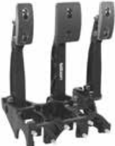
Right: Tilton 3 Aluminum Pedals, Underfoot Mount Part No. TE 72-616 Master cylinders (sold separately) point backward under the driver's feet