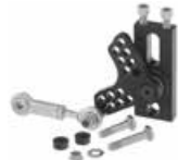
Left: Tilton Standard Throttle Linkage Part No. TE 72-791 Fits 600-Series pedals except Underfoot