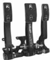
Left: Tilton 3 Aluminum Pedals, Floor Mount Part No. TE 72-603 Master cylinders (sold separately) point forward through the bulkhead