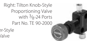
Right: Tilton Knob-Style Proportioning Valve with 3/8-24 Ports Part No. TE 90-2000

Brake Proportioning Valves Allow a driver to reduce brake pressure to a specific wheel or wheels. This can be used to adjust front-to-rear brake bias in cars where brake balance bars are not allowed or are not practical. The maximum reduction of output pressure is approximately 50% of the input pressure. Complete instructions are included.