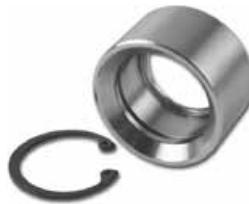
Left: Spherical Bearing Weld Cup Part No. 1825-150-Size

These chromoly cups are perfect for fabricating A-arms and other suspension components. Four sizes are designed specifically to fit one of our Narrow Series Aurora spherical bearings above. The bearing is retained in the cup by a C-clip (included) on one side and a ridge on the other. For best results, the cup should be oriented so that the primary axial force pushes the bearing toward the ridge. Heavy-wall construction resists deformation from welding heat. Cups are sold individually. CNC manufactured in the USA.