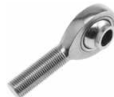
Typical High-Misalignment Alloy Steel Rod End, Part No. 3064

Note: Only available with male threads (female threaded version is not available)