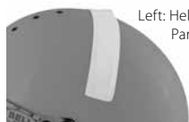
Left: Helmet Top Wicker (Small) Part No. BE208-Small

Rear Spoiler, Clear, V.06 for helmets without vents ... Part No. BE204-Clear ..... $79.95 Rear Spoiler, Clear, V.09 for helmets with rear vents ... Part No. BE205-Clear ..... $79.95