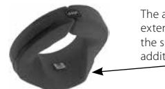
Below: OMP Anatomical Neck Collar Part No. 2123-Color

The anatomical shape extends down between the shoulders for additional support