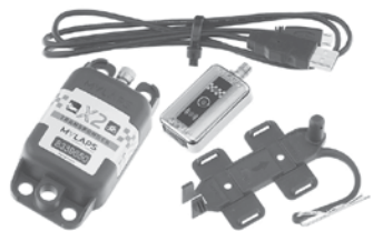
X2 Rechargeable Transponder, Part No. 5001-50x Clockwise from lower left: X2 Transponder, USB cable, quick-release mounting bracket. The X2 RaceKey is in the center of the photo.

AMB / MYLAPS Transponders are required by many auto racing organizations, from club to pro. A unique identification number encoded in each transponder is transmitted to a receiving loop embedded in the track at the start/finish line. Each time the transponder passes the loop, the MYLAPS timing and scoring system recognizes the transponder and matches it to the correct car. Some organizations specify the transponder mounting location on the car (check your rule book). The transponder must be mounted upright, with a clear view of the track surface. AMB / MYLAPS transponders are required by SCCA, NASA, PCA, MCSCC, VSCDA, and many others.