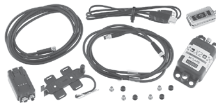
X2 Direct-Wire Transponder Kit, Part No. 5001-51x Clockwise from lower left: X2 RaceKey Mount, power cable, USB cable, X2 RaceKey, X2 Transponder, permanent-mount hardware, quick-release mount bracket. The cable in the center connects the X2 Transponder to the X2 RaceKey Mount in the car.

The X2 Rechargeable Transponder mounts to a quick-release bracket. Just 4 hours of charging using the included X2 RaceKey provides 4 days of run time. A 2-color LED indicates battery condition and subscription status. The X2 Rechargeable can be used on any car, but it is required for cars running an electrical system other than 12 volts (6V, 16V, 24V, or magneto with no battery). Includes X2 Transponder, quick-release mounting bracket, X2 RaceKey, and USB cable.