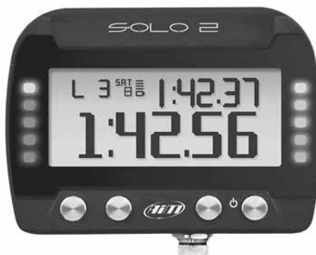
AiM Solo2 Lap Timer (stand-alone version) Part No. MC-670

The ultimate lap timer - and more! You won't believe that something so easy to use can be so powerful. The amazing AiM Solo2 uses satellite signals (both GPS and Glonass) to start and stop lap times at the start/finish line. No other equipment is required. The Solo2 automatically recognizes the track from memory, or you can add the track to the database when you arrive. Solo2 also logs extensive GPS data (exact track position, speed, acceleration rates in 3 directions, and more) for detailed analysis later. The included Race Studio software can even generate track maps and replay any two laps together for comparison. The internal rechargeable battery means no wiring connections are needed. Measures only 3.9" x 3.1" x 1.2" thick - small enough to mount directly on your steering wheel, even in a formula car.