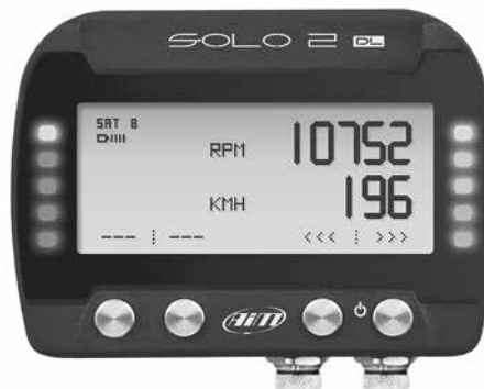
AiM Solo2 DL Lap Timer / Data Logger Part No. MC-671 / MC-672 / MC-673

If your chosen track does not have a map in GPS Manager, you can create one by running (or even walking) a single lap with the Solo2. As you go around the track, the Solo2 will record your position 10 times a second (using powerful algorithms and other data to fill in the gaps between). Download the lap to Race Studio, and GPS Manager will let you import the track shape that was recorded on that lap. You can now use that track map on your SmartyCam's video overlay!