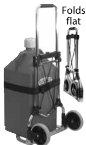
Right: Fold-Up Cart for Flo-Fast Pump Systems Part No. 2577-020 (shown with 15 Gallon Jug, sold separately)