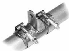
Above: Floating Saddle Mount shown installed on a chassis tube (T-Bolt clamps not included)

Put a mounting tab anywhere you want on a chassis tube with no welding required! Simply clamp a Floating Saddle Mount to your tube using two hose clamps (not included). The 1/8" thick chromoly tab is TIG-welded perpendicular to the 1/16" thick saddle (a bolt through the hole will be parallel to the tube). Generous gussets on both sides keep the tab upright. The 3/8" diameter hole is perfect for mounting control cables, but these mounts can be used in many other light-duty applications as well.