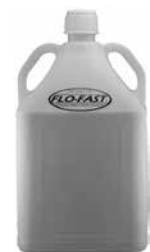
Left: 15 Gallon Clear Utility Jug Part No. 2577-031

Please Note: Flo-Fast pump systems do not include jugs or drums.