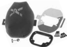
Left: Pipercross PX300 Filter Kit for Weber 32/36 DGV Part No. 1265-001 Includes Filter Element (Part No. 1265-002) and Base plate (Part No. 1265-003)