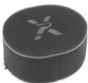
Pipercross PX400 Filter for Weber 32/36 DGV Part No. 1265-005 Includes foam base gasket and hold-down O-rings

Pipercross Air Filters have been used on winning vehicles at all levels of motorsports. The 3-layer foam traps and holds more dust and dirt than other filter media. This filters air more thoroughly while also allowing longer service intervals. These filters draw air through the top as well as the sides for maximum airflow. The foam can be deformed if needed to fit within tight bodywork.