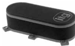
Above: ITG Megaflow JC90 Filter Part No. 3815 Sold in pairs with base plates drilled for Weber IDA Triple

JC100 "Multi Carburetor" measure 23.9" x 5.6": JC100/25, 50mm (2") tall ..... Part No. 3817-100-25 ..... $249.99 JC100/40, 65mm (2.6") tall ..... Part No. 3817-100-40 ..... $249.99 JC100/65, 90mm (3.5") tall ..... Part No. 3817-100-65 ..... $249.99 JC100/100, 125mm (4.9") tall ..... Part No. 3817-100-100 ..... $249.99 Blank Base Plate only for JC100, aluminum ..... Part No. 3817-009 ..... $29.99