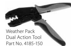
Weather Pack Dual Action Tool Part No. 4185-150

These economical tools will crimp most sizes of Weather Pack terminals and cable seals. The Pro Tool requires two separate operations to crimp the terminal and the seal. Many professionals prefer the extra level of control this allows. The Dual Action Tool crimps both terminal and seal in one single operation. Both tools have a ratcheting function to ensure consistent, uniform crimps. For 20-14 gauge terminals.