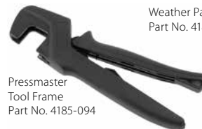
Weather Pack Die Set Part No. 4185-095