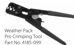
Weather Pack Pro Crimping Tool Part No. 4185-099