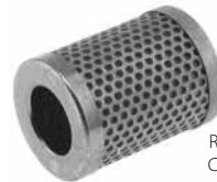
Replacement Short Canton Oil Element Part No. 1291