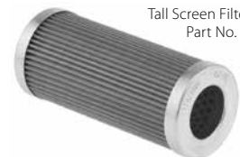
Tall Screen Filter Element Part No. CM 26-150

Protect your expensive dry sump pump! Install one of these screen elements in a Canton remote-mounted oil filter (above left) for a free-flowing scavenge filter. The coarse 400 mesh allows free flow, yet catches the larger debris (40 micron and larger) that can destroy dry sump pumps. These elements are not for use for final oil filtration. The Short element fits the 4" remote-mount housing. The Tall element fits the 6" remote-mount housing. Sold individually.