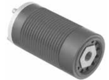
Right: 6.25" Filter Part No. 1284

Remote Mount Canton Oil Filters These filters have very strong yet lightweight machined aluminum housings. The inlet in one end cap and the outlet in the side are both -12 O-ring ports for reliable, leak-free connections. We stock adapter kits separately to convert these O-ring ports to a variety of male AN sizes. The 4-bolt housings are easily disassembled to replace the filter element or to inspect for signs of engine damage. The billet aluminum housings are blue anodized with clear anodized end caps. A standard 8 micron filter element is included.