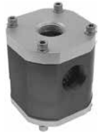
Right: Mounting Clamp for Billet Filters Part No. 1281-003