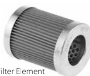
Short Screen Filter Element Part No. CM 26-050