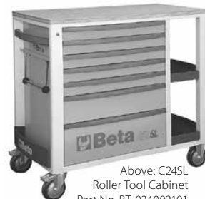
Above: C24SL Roller Tool Cabinet Part No. BT-024002101