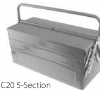
C20 5-Section Cantilever Tool Box Part No. BT-021200001