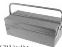
C19 3-Section Cantilever Tool Box Part No. BT-021190001