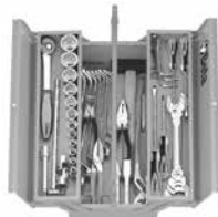
C19 3-Section Cantilever Tool Box Opened to show 2 lift-out trays Tools sold separately