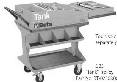
Tools sold separately