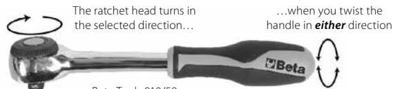
Beta Tools 910/58 Rotating Handle 3/8" Ratchet Driver, Part No. BT-009100884

This ratchet driver is a real time saver. The 3/8" square drive is compatible with any standard 3/8" socket or drive accessory. The reversible 52-tooth drive requires just 7 degrees of take-up. But if you're working in an area even tighter than that, just twist the handle like a screwdriver. The special gear mechanism inside will turn the ratchet drive when you twist the handle! Even better, when you twist the handle back to take another twist, the ratchet will turn again. You get two turns from each twist and recoil, without ever letting go of the handle. Great for quick spinning during assembly. Twist the handle for quick driving, then push the handle to deliver the final tightening torque. A retaining ball with a release button on the back of the ratchet head keeps your socket firmly in place. Chrome shaft with a black reversing dial and orange release button. The Beta orange molded BetaGrip handle has black rubberized inserts. Sockets sold separately.