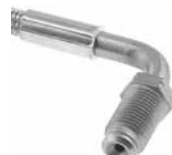
HE606-03P-090 90° 10x1.0mm male hose end with convex seat in unplated steel (mates to HE551-03P-000 at left)