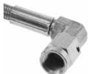
HE014-03P-090 90° 3AN female hose end in forged plated steel