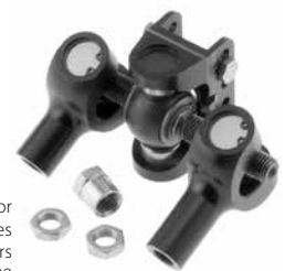
Brake Bias Bar for Tilton 77-Series Master Cylinders Part No. TE 72-280

The Tilton 900-Series Pedal Assembly is designed to work with the Tilton 77-Series rear-pivoting master cylinders (sold separately). This combination minimizes friction and lost motion to provide the most consistent and repeatable braking possible. The billet aluminum pedals pivot on ball bearings for smooth motion without any side play. The special pivoting bias bar (included) bolts in place on the brake pedal. It can be mounted in 8 different positions to adjust pedal ratio quickly from 4.52:1 to 5.80:1. Needle bearing pivots in the bias bar prevent bias creep and migration found in conventional spherical bearing bias bars. The pedal pads are also adjustable vertically and horizontally for best fit and easy heel-and-toe downshifting. Master cylinders sold separately.