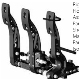
Right: Tilton 900-Series Floor-Mount Pedal Assembly Part No. TE 72-903 Shown with 77-Series Master Cylinders Part No. TE 77-xxx (sold separately)