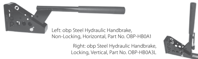
Left: obp Steel Hydraulic Handbrake, Non-Locking, Horizontal, Part No. OBP-HB0A1