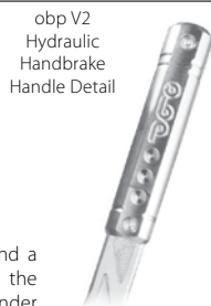
obp V2 Hydraulic Handbrake Handle Detail

The Pro-Drift V2 series feature a billet aluminum handle and a lightweight fabricated steel base. They can be set up with the handle oriented either vertically or horizontally. Master cylinder sold separately.