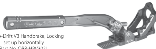
obp Pro-Drift V3 Handbrake, Locking set up horizontally Part No. OBP-HBV302L

V3 Hydraulic Handbrake, Non-Locking ..... Part No. OBP-HBV302 .....$409.99 V3 Hydraulic Handbrake, Locking ..... Part No. OBP-HBV302L .....$429.99 The V3 handle adjusts from 320mm to 380mm (12.6" - 15").