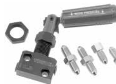
Left: Tilton Lever-Style Proportioning Valve with 3/8-24 Ports Part No. 3528-3AN