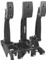
Right: Tilton 3 Aluminum Pedals, Underfoot Mount Part No. TE 72-616 Master cylinders (sold separately) point backward under the driver's feet