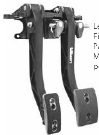
Left: Tilton Dual Aluminum Pedals, Firewall Mount Part No. TE 72-607 Master cylinders (sold separately) point forward through the firewall

See below for Remote Bias Adjuster Cables for the Brake Balance Bar