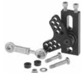
Left: Tilton Standard Throttle Linkage Part No. TE 72-791 Fits 600-Series pedals except Underfoot