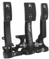
Left: Tilton 3 Aluminum Pedals, Floor Mount Part No. TE 72-603 Master cylinders (sold separately) point forward through the bulkhead