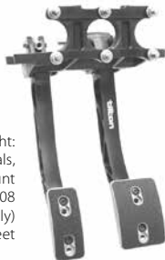
Right: Tilton Dual Aluminum Pedals, Overhung Mount Part No. TE 72-608 Master cylinders (sold separately) point backward over the driver's feet