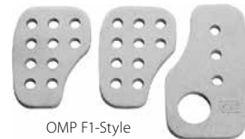
OMP F1-Style Pedal Pad Set Part No. OMP-OA1030

These kits give you a wider surface area for better contact and feel than your stock pedals. Each kit includes 3 aluminum pads (clutch, brake, throttle) and attachment hardware.