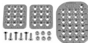
OMP Cast Aluminum Pedal Pad Kit Part No. 2701