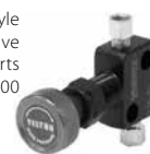
Right: Tilton Knob-Style Proportioning Valve with 3/8-24 Ports Part No. TE 90-2000

Brake Proportioning Valves Allow a driver to reduce brake pressure to a specific wheel or wheels. This can be used to adjust front-to-rear brake bias in cars where brake balance bars are not allowed or are not practical. The maximum reduction of output pressure is approximately 50% of the input pressure. Complete instructions are included.