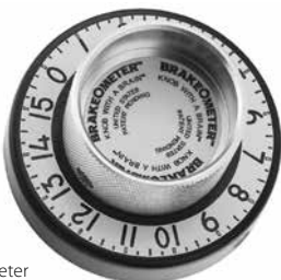
Right: BrakeOMeter Remote Adjuster Knob for Sedans Part No. BOM-AR16

Master cylinder bore size is the primary factor affecting brake bias. A balance bar is for fine adjustment. This precision Tilton unit distributes the pedal force between two brake master cylinders. Turning the 7/16-20 threaded bar moves the pivot point to change the force distribution. Accepts standard 5/16-24 master cylinder pushrods. The pivot sleeve must be brazed or welded to the brake pedal. Designed for 2 1/2 inch master cylinder spacing.