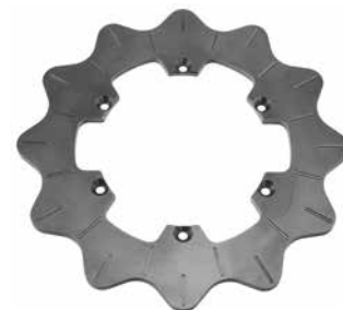
TDI Grooved and Scalloped Brake Disc Part No. 3544-002-01