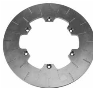
TDI Grooved Brake Disc Part No. 3544-001-01

10.12" OD (LD 20)..... Part No. 3544-002-02 ..... $184.99