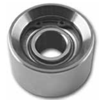
Right: Shown with Spherical Bearing (sold separately)

Left: Installation example Only trust highly skilled welders to fabricate critical suspension components!