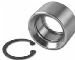
Left: Spherical Bearing Weld Cup Part No. 1825-150-Size

These chromoly cups are perfect for fabricating A-arms and other suspension components. Four sizes are designed specifically to fit one of our Narrow Series Aurora spherical bearings above. The bearing is retained in the cup by a C-clip (included) on one side and a ridge on the other. For best results, the cup should be oriented so that the primary axial force pushes the bearing toward the ridge. Heavy-wall construction resists deformation from welding heat. Cups are sold individually. CNC manufactured in the USA.