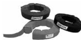
Above: Simpson SFI 3.3 Neck Collars Part No. 2120-Color

Note: These neck collars are not safety devices. They are not intended to take the place of a Head and Neck Restraint device. They will not satisfy requirements for an SFI 38.1 or FIA 8858 Frontal Head Restraint (FHR). See page 14 for SFI and FIA Head and Neck Restraints.