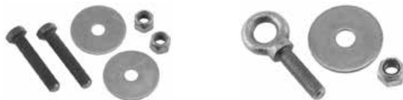
Above: Bolt-in Hardware Kit Part No. 2383 Above: Eyebolt Hardware Kit Part No. 2384