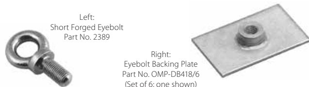
Left: Short Forged Eyebolt Part No. 2389