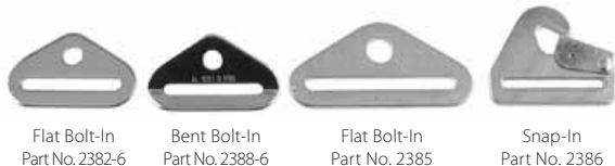
Flat Bolt-In Part No. 2382-6 Bent Bolt-In Part No. 2388-6 Flat Bolt-In Part No. 2385 Snap-In Part No. 2386

Bolt-In End Plates Available either flat or bent with \frac{3}{8} " or \frac{1}{2} " mounting hole. For two or three inch wide straps (see diagram below right for installation): \frac{3}{8} inch Mounting Hole FLAT Bolt-In End Plate ..... Part No. 2382-6 ..... $4.99 \frac{3}{8} inch Mounting Hole BENT Bolt-In End Plate ..... Part No. 2388-6 ..... $4.99 For 3" wide straps – has a 3" wide slot and should NOT be used with 2 inch straps. \frac{1}{2} inch Mounting Hole FLAT Bolt-In End Plate ..... Part No. 2385 ..... $4.49 With 3 inch wide slot - for 3 inch straps only.