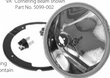
Cibié Oscar SC Driving Lamp "VA" Cornering Beam shown Part No. 5099-002

Note: An acrylic or polycarbonate fairing is highly recommended with these lamps to protect the lens from damage. Many racing organizations also require such a cover to contain any glass shards in the event of breakage.