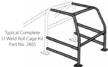
Typical Complete U-Weld Roll Cage Kit Part No. 2405

Bolt-In Cross Brace Option ..... Part No. 2408 ..... $109.99 Replaces the welded braces included with roll bar; can be removed when not racing to allow use of the back seat.