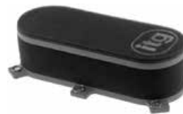
Above: ITG Megaflow JC90 Filter Part No. 3815 Sold in pairs with base plates drilled for Weber IDA Triple

ITG has been manufacturing high-quality foam air filters for all levels of motorsport since 1987. ITG Megaflow filters feature 3-stage foam to combine efficient filtration and very high dust holding capacity with excellent airflow. A heavily-soiled ITG Megaflow filter can outflow just about equivalent paper air filter! ITG Raceair filters are designed just for racing use, with 2-stage foam for even better airflow at the expense of filtration and dust holding. Both styles mount to the base plate with quick-release quarter-turn fasteners.