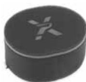
Pipercross PX400 Filter for Weber 32/36 DGV Part No. 1265-005 Includes foam base gasket and hold- down O-rings

Pipercross Air Filters have been used on winning vehicles at all levels of motorsports. The 3-layer foam traps and holds more dust and dirt than other filter media. This filters air more thoroughly while also allowing longer service intervals. These filters draw air through the top as well as the sides for maximum airflow. The foam can be deformed if needed to fit within tight bodywork.