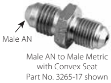
Male metric convex seat Male AN