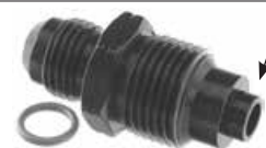
Step seat on metric end seals with an O-ring

The metric end of these aluminum adapters has a step seat for an O-ring (included). This fitting type is used in some fuel injection systems. Note: These aluminum fittings are for low-pressure applications such as fuel and oil systems only. They are not for use in power steering systems!