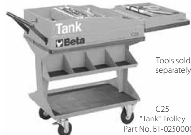
Tools sold separately