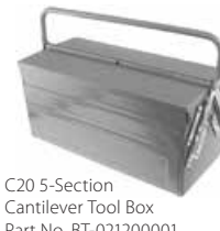
C20 5-Section Cantilever Tool Box Part No. BT-021200001