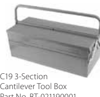
C19 3-Section Cantilever Tool Box Part No. BT-021190001