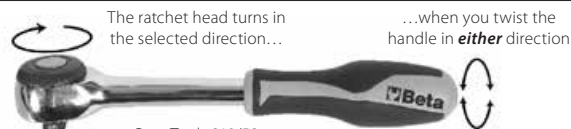
Beta Tools 910/58 Rotating Handle 3/8" Ratchet Driver, Part No. BT-009100884

This ratchet driver is a real time saver. The 3/8" square drive is compatible with any standard 3/8" socket or drive accessory. The reversible 52-tooth drive requires just 7 degrees of take-up. But if you're working in an area even tighter than that, just twist the handle like a screwdriver. The special gear mechanism inside will turn the ratchet drive when you twist the handle! Even better, when you twist the handle back to take another twist, the ratchet will turn again. You get two turns from each twist and recoil, without ever letting go of the handle. Great for quick spinning during assembly. Twist the handle for quick driving, then push the handle to deliver the final tightening torque. A retaining ball with a release button on the back of the ratchet head keeps your socket firmly in place. Chrome shaft with a black reversing dial and orange release button. The Beta orange molded BetaGrip handle has black rubberized inserts. Sockets sold separately.