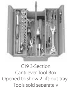
C19 3-Section Cantilever Tool Box Opened to show 2 lift-out trays Tools sold separately