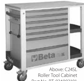
Above: C24SL Roller Tool Cabinet Part No. BT-024002101