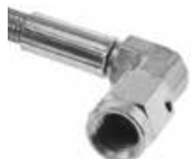
HE014-03P-090 90° 3AN female hose end in forged plated steel