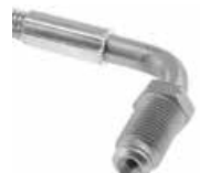
HE606-03P-090 90° 10x1.0mm male hose end with convex seat in unplated steel (mates to HE551-03P-000 at left)