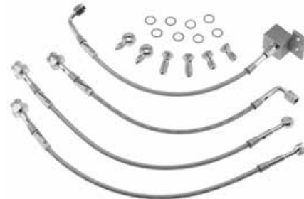
G-Stop Brake Line Kit for 89-05 Mazda Miata Part No. GS-25001