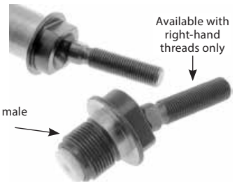
Right: Dallara-Style Compact Rack End Joints Part No. 1804-5/16-Compact Sold individually (two shown for illustration)