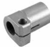
Above: Rigid Coupler for 3/4 inch Steering Shaft Part No. 1805-75