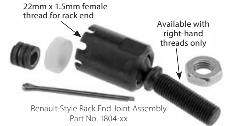
Renault-Style Rack End Joint Assembly Part No. 1804-xx