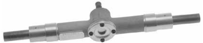
Stock Steering Rack, Part No. 1802

This pinion produces 2.54" of rack travel per full turn of the pinion. This is the standard pinion installed in our steering racks.