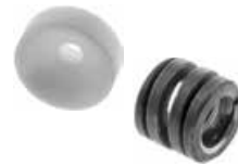
Left: Replacement Parts for Renault-Style Rack End Joints Part No. 1804-Cup and Part No. 1804-Spring Sold individually