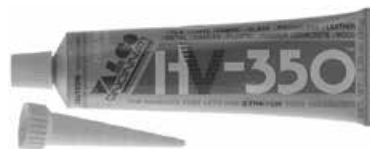
HV-350 Flexible Adhesive Part No. 3435-001

HV-350 Flexible Adhesive, 3.35 oz tube ..... Part No. 3435-001 ..... $7.99