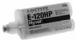
Above: Loctite E-120HP Hysol Epoxy, 200 ml Cartridge Part No. LT-29354