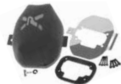
Left: Pipercross PX300 Filter Kit for Weber 32/36 DGV Part No. 1265-001 Includes Filter Element (Part No. 1265-002) and Base plate (Part No. 1265-003)