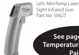
Left: MiniTemp Laser Sight Infrared Gun Part No. 50627

See page 137 for Temperature Indicating Paints