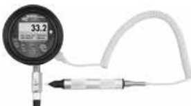
Left: Combination Tire Pressure Gauge and Pyrometer Part No. LA53050