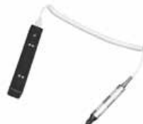
Right: Longacre Pyrometer Module for 7" Tablet Part No. LA50745 (Tablet not included)