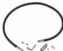
Left: Trunk-Mount (rubber hose) Part No. 3333-001