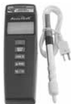
Right: Longacre AccuTech Economy Digital Pyrometer Part No. LA50635