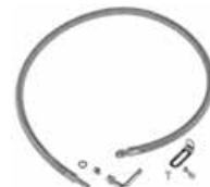
Right: Under-Chassis (stainless braided hose) Part No. 3333-002

Don't get caught with a flat tire AND a flat spare! Our Spare Tire Inflation Systems bring the tire valve to you, making it easy to check and inflate. A 36" long hose attaches to your spare tire valve and removes easily with no tools required. A bracket can be used to hold the loose end of the hose in place, and a 90 degree adapter is included for tight installations. The Trunk-Mount system is designed for vehicles with the spare located in the trunk or enclosed cargo area. It uses a lightweight rubber hose. The Under-Chassis system has a stainless-steel braided hose for vehicles where the spare is located outside in the elements.