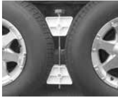
Left: Trailer Aid Wheel Stop, Small Part No. 2360-005