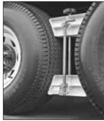
Right: Trailer Aid Wheel Stop with Lock, Large Part No. 2360-001

Stop trailer theft! The Wheel Club is made by the same company that brought you "The Club" steering wheel lock. The Wheel Club clamps across any tire from 21" to 28" diameter and up to 9" wide. Just spread the Y-arms over the tire and slide the third arm into the body until all three arms are tight against the tire. Then push in the lock cylinder and remove the key. The lock plate restricts access to the lug nuts so thieves can't just take the wheel off. Bright red finish acts as an excellent theft deterrent. Lock cylinder includes a weatherproof cap and two keys.