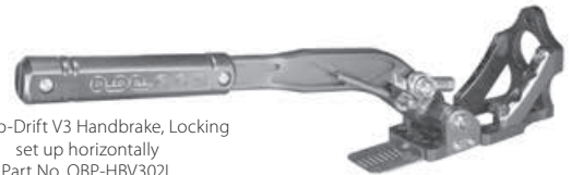
obp Pro-Drift V3 Handbrake, Locking set up horizontally Part No. OBP-HBV302L

V3 Hydraulic Handbrake, Non-Locking ..... Part No. OBP-HBV302 ..... $519.00 V3 Hydraulic Handbrake, Locking ..... Part No. OBP-HBV302L ..... $544.00 The V3 handle adjusts from 320mm to 380mm (12.6" - 15").