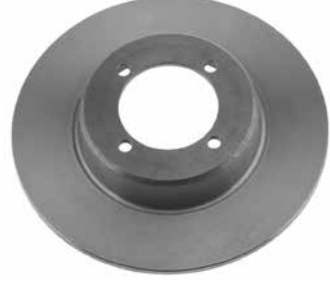
Cast Iron Rotor with Integral Hat, Standard Part No. 3545-10

* This size can be used to convert the front rotor on 1981 and older Tiga FF and S2000. Visit our website for full instructions!